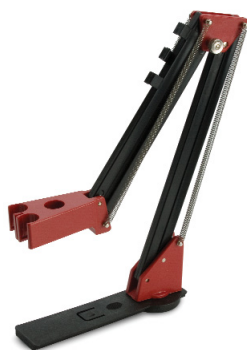
HI 76404 — Electrode Holder

During this step, the memorized buffer may be changed to match the calibration buffer.